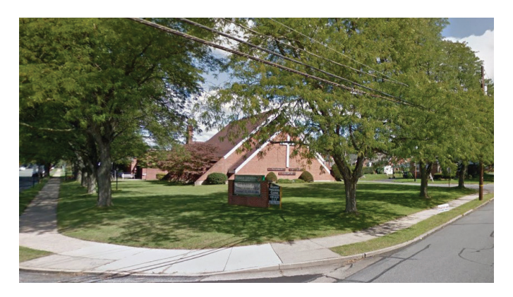
Light of Christ Lutheran Church

If you don't wish to play, come, listen and bring food to share and let us know what you are bringing.