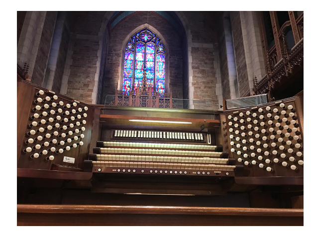
St. John's, Allentown, 1993 IV/87 Reuter

Community Parking Deck at 6th & Walnut — $1 per hour