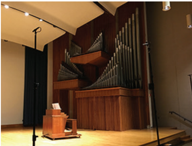
1965 II/37 Holtkamp Organ Company, Job No. 1793

On Tuesday, April 4, I attended the farewell recital for the 1965, II/37 Holtkamp pipe organ at Penn State. The instrument is currently up for auction.