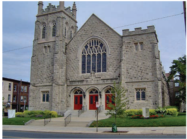
Christ Lutheran Church, Allentown