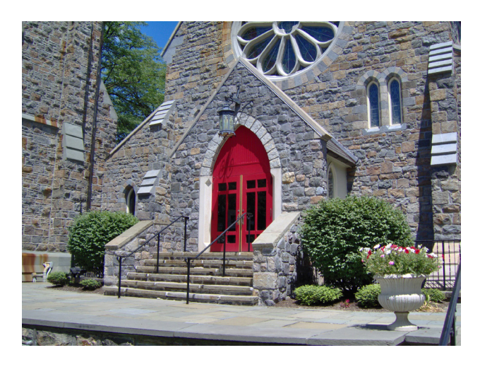
Cathedral Church of the Nativity